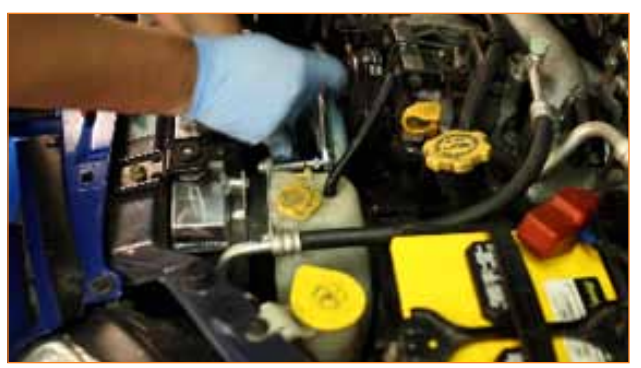
3. Reconnect the upper radiator hose to the radiator.

2. Reinstall the coolant reservoir tank, which is secured to the fan shroud with two 10mm bolts. Then reconnect the coolant feed hose to the reservoir.