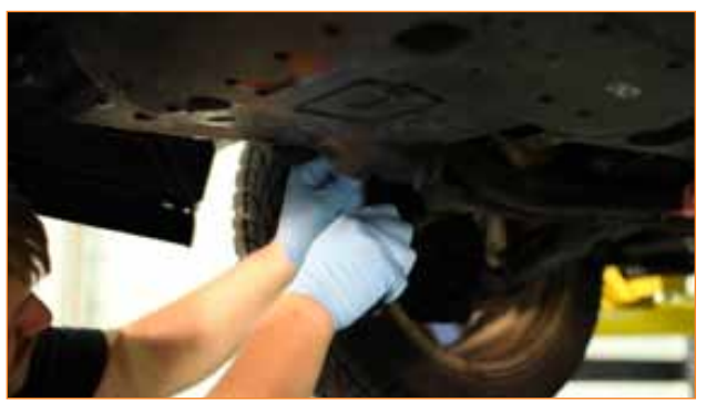
8. You have now successfully installed your new Mishimoto Plug-N-Play Fan Shroud. Enjoy!